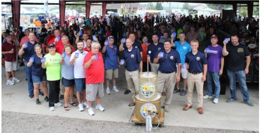
Hecker officials & 125th committee members along with other local officials toast from the ceremonial golden keg at the start of the festival.

After a major delay due to the COVID-19 pandemic the Hecker Quasquicentennial Parade and Festival was finally held on September 4th. After a rainy morning nearly 75 entrants paraded through town from the village park to the community center park. After the parade, village officials, 125th committee members and other local officials toasted from the golden keg. Residents past & present, guests, and various organizations celebrated through the night keeping mind of how Hecker got it's roots and the memories along the 125 year path. Kids explored the rides while parents celebrated. Free history booklets were given out during the parade. Those booklets are still available at the post office and village hall on Thursdays from 6PM-8PM. Also available while supplies last are souvenirs including t-shirts, glasses, metal signs, Christmas ornaments, glasses, cups, beer buckets and more.