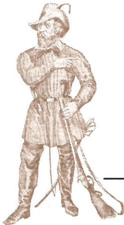
Col. Frederick Hecker